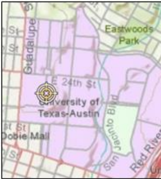
University of Texas at Austin

Using ArcGIS Explorer Online and zooming to Austin and Logan reveals the following designated locations for these universities. Convert these locations into decimal degrees. Find the great circle distance between Austin and Logan in km if the radius of an equivalent spherical earth is 6371.0 km. Elevations for these locations were determined using Google Earth. 1 ft = 0.3048 m. Compute the slope along the great circle distance and indicate whether, based on this slope, water would flow from Austin to Logan or Logan to Austin along this path.