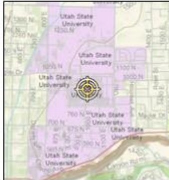
Utah State University